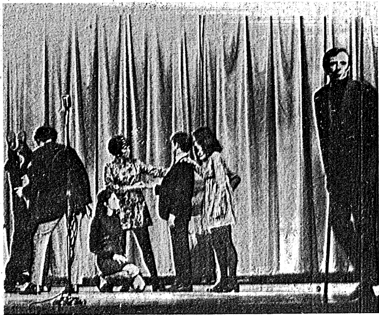
Controversial Committee performs in an unique and original way—gains standing ovation from Student Body and raised eyebrows from the administration.